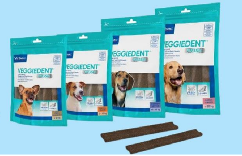
VeggieDent Chews for Dogs: FR3SH Technology for Fresh Breath Helps Reduce Plaque & Tarter Formation

C.E.T HEXtra Chews for Dogs: Freshens Breath, Reduces plaque and tarter, and cleanses the teeth