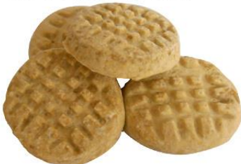
PEANUT BUTTER COOKIES $1.25