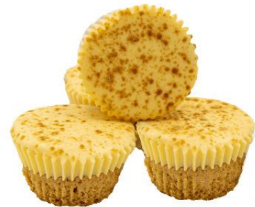
CREME BRULEE $1.75