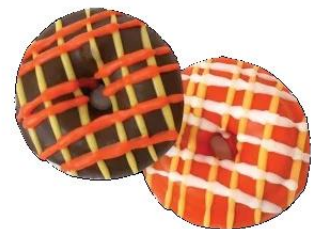
PEANUT BUTTER CUP $1.75